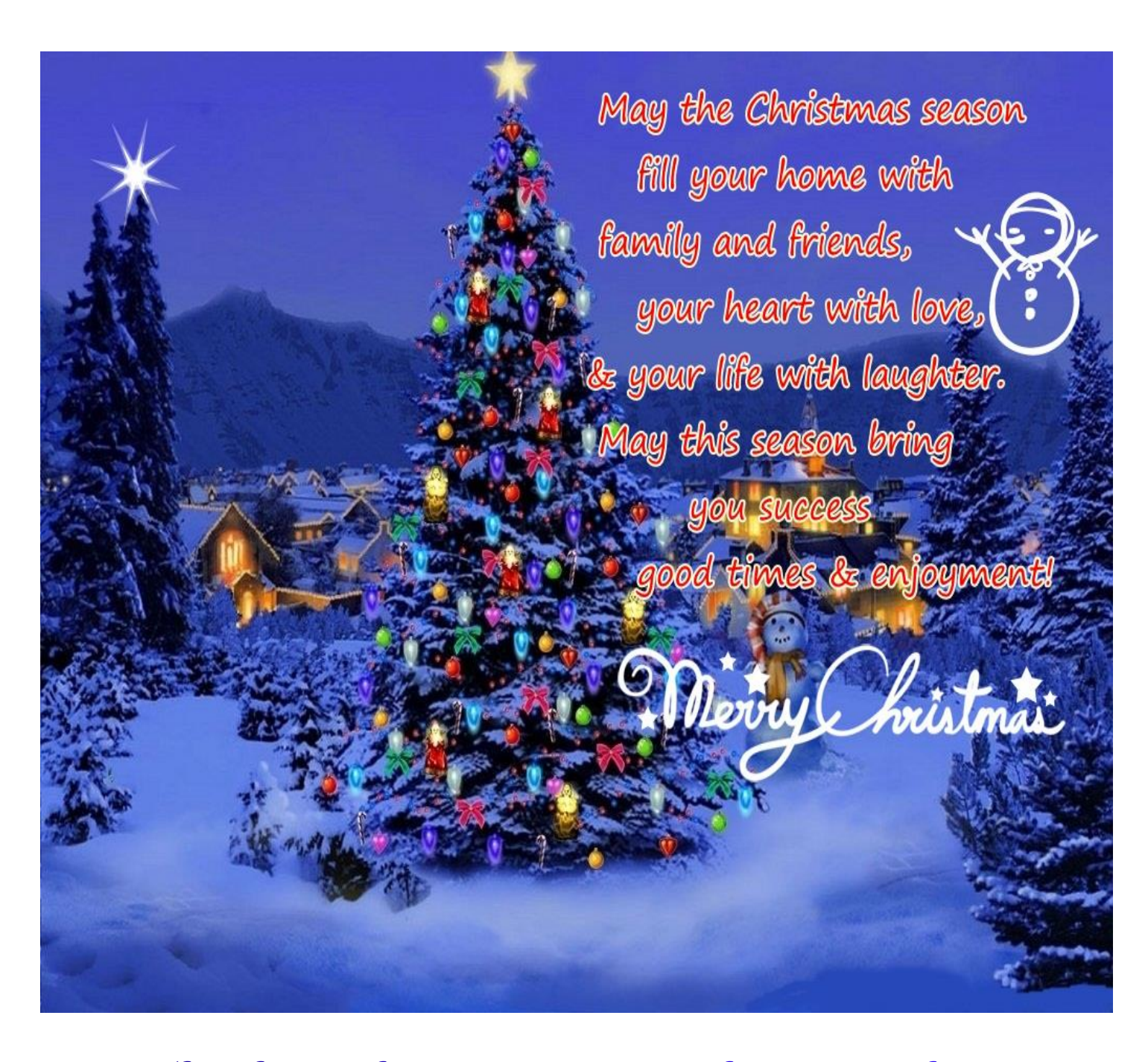
Thank You for your continued support of OPI All the Best in 2016!